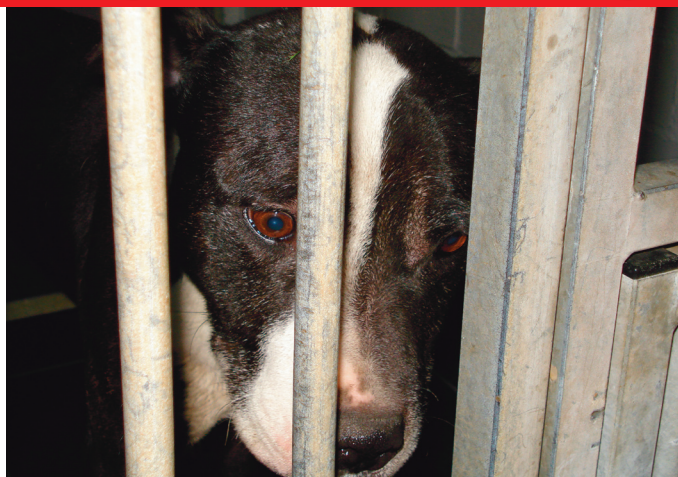
Original Photo of a confiscated dog (20.04.2007)

The exact number of the confiscated dogs as well as the whereabouts of the "Laser-Asiels" (detention kennels) is kept secret.